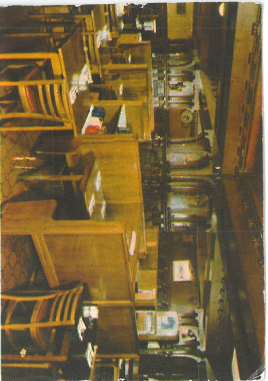
Above is the interior of the famous Grill Room of The Westbrook Hotel. Shown below is the interior of the gracious Coffee Shop and Dining Room.